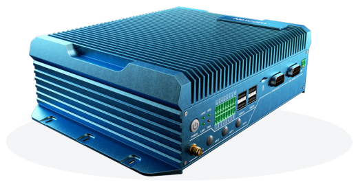
Model: NTE-XE 100

Hardware tough enough for the factory, smart enough for the boardroom.