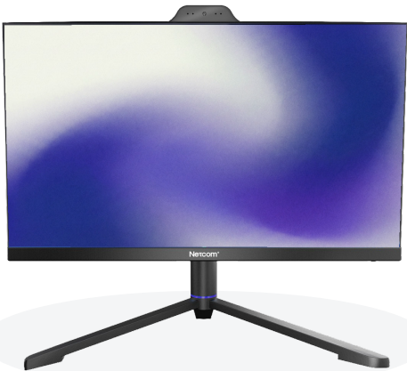
Model: NTE-AIO 310

One-key fingerprint unlock and physical camera privacy switch for total data protection.