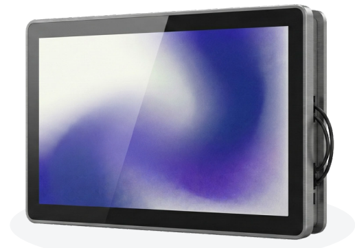
Model: NTE-XE 200

Equipped with 14 GPIO ports , 6 COM ports, and dual Gigabit LAN for industrial automation.